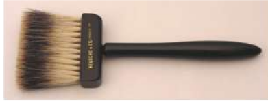
SERIES 31S —FRENCH BADGER BLENDER SIZE 3" $75.00