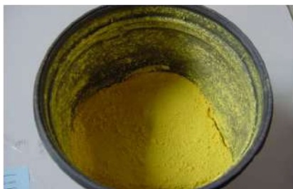
Pre-Mixed Color Available