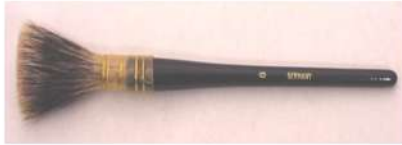
SERIES 32 —GERMAN ROUND BADGER BLENDER PRICE EACH SIZE 6 $30.00